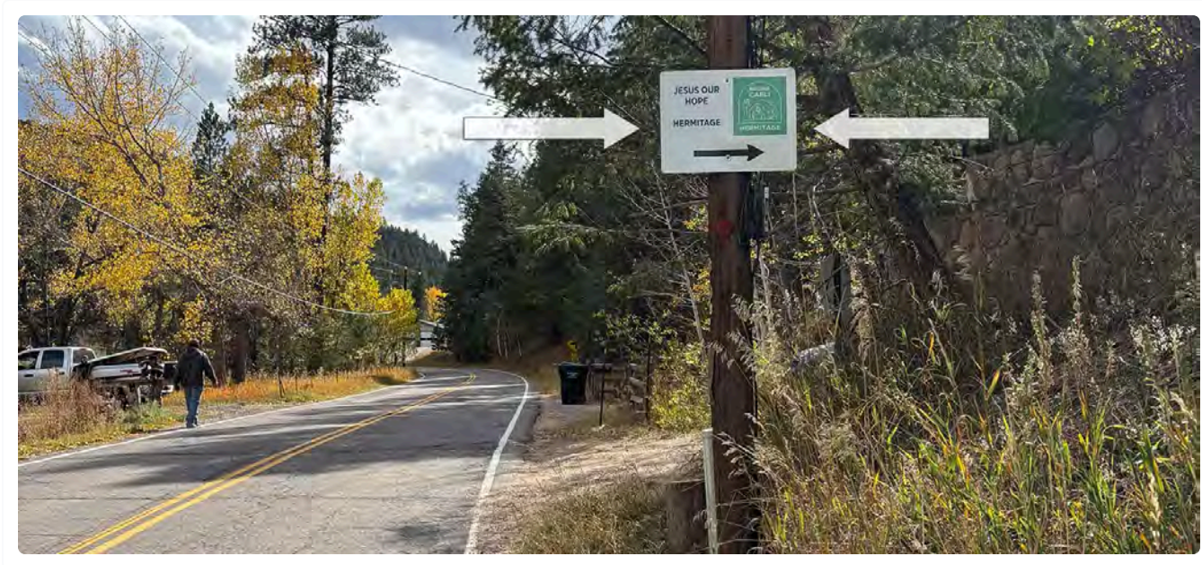
The sign is new as of fall 2024 and may not appear in GPS street view.

7. Continue approximately 30 yards and note the Jesus Our Hope Hermitage / Regina Caeli sign.